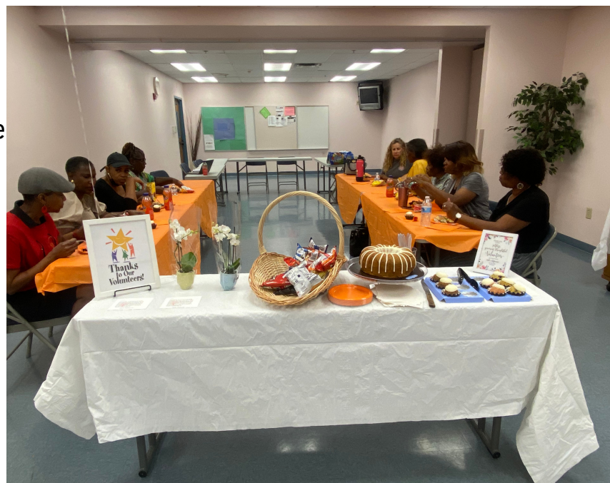
Volunteer Appreciation Lunch